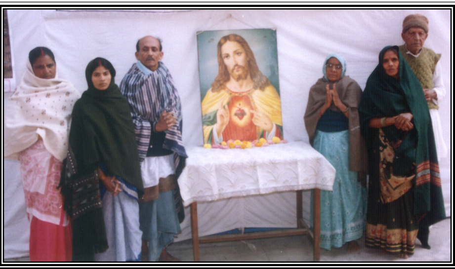
"THE WORD OF GOD IS OUR STRENGTH" - ALL THESE BEDRIDDEN PERSONS CAME UP TO GIVE THEIR WITNESSES ON STAGE

Then one fine day (about a month before) one of my neighbours told me about this place and about the innumerous miracles that happen here. I made up my mind to have a try here too. The following Sunday I came here and saw all that happened here and this induced faith in me. After the prayer service I felt a little better. When I came here the next time, 'behanji' (the lady chosen and blessed by God who preaches and proclaims the Word of God and announces the healings taking place as seen in the vision) announced, 'Merciful Lord is blessing one brother whose nerves in the leg are blocked and therefore there is no blood circulation. If anyone having such problem feels better, he can come on the stage to give away his witness.' I knew out of faith that she was mentioning about me and no one else and indeed that day my numb leg was completely healed and brought back to the normal state only by God's grace. From that day onwards I could walk with confidence anywhere, anytime. God heard my prayers, healed and saved my diseased leg and strengthened my faith in Him. Yesterday. I even saw Him in a vision when I was lying down getting ready to sleep. He caressed my leg and asked me, "Son, How are you? Is your leg alright?"And then He disappeared walking away to the mountains. So, I have come here to-