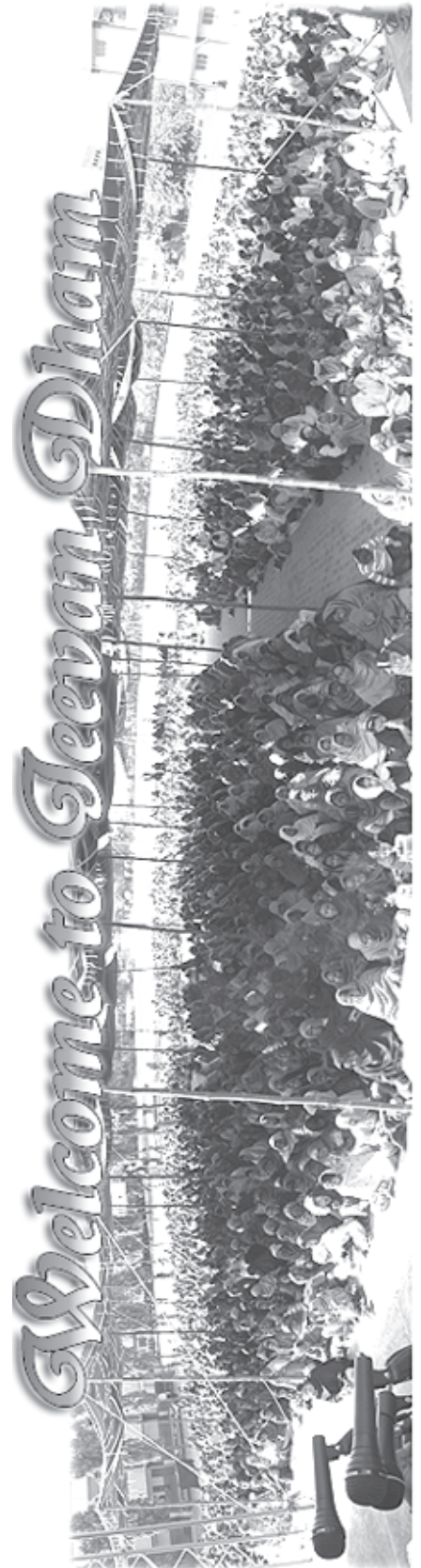
The crowd gathered for the Sunday Prayer service at Jeevan Dham. God says, "Ho, everyone who thirsts, come to the waters; and you that have no money, come, buy and eat!" (Isaiah 55:1)