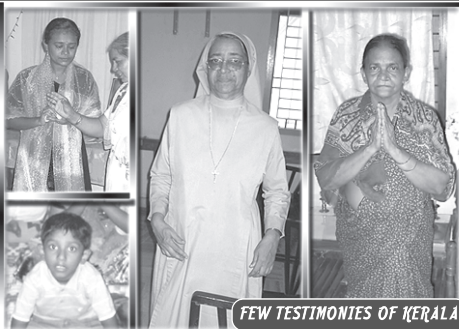
FEW TESTIMONIES OF KERALA