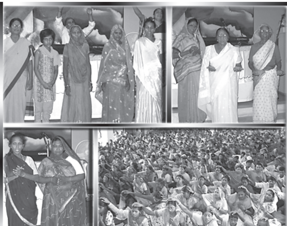
Fatima Mata Susamachar Kendra, Patna ..FEW TESTIMONIES & The Crowd

'The harvest is plenty and the labourers are few' but time is short is the divine message that has been repeatedly given to the family of JEEVAN DHAM to continue its regular proclamation of the Word outdoors which had begun last October.