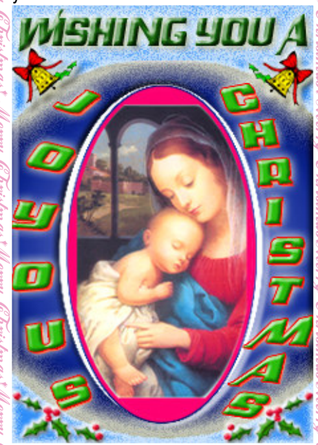
AND A PROSPEROUS NEW YEAR 2006! To all readers of DIVYA-JYOTI! With prayers and love, from the EDITOR and all at

If you are unprepared this CHRISTMAS, you, too, will miss the opportunity to experience Jesus. You may practice religion, but you will miss God. While others encounter the Lord personally in worship, your heart will remain unmoved. As others receive a fresh word from God, you experience a painful silence. Religious activity can never substitute for a heart that is pure before Him. Purity comes only through repentance. Therefore pray with a humble and contrite heart, as the scalmet did, that God will examine your heart and reveal your need to recent of your sin. (Psalms 139, 23-24) Your repentance can clear the way of the Lord to your heart, who will guide you through His SPIRIT, HEAL your body and soul, fill you with His PEACE, LOVE and JOY, and protect you from all harm.