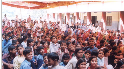
THE GATHERING ON NOVEMBER 6 AT NISHKALANK MATA SCHOOL, JAITH, MATHURA FOR THE PRAYER CONVENTION.