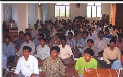
THE STUDENTS LISTENING ATTENTIVELY DURING THE PRAYER SESSION AT ETMADPUR MAJOR SEMINARY ON OCTOBER 12