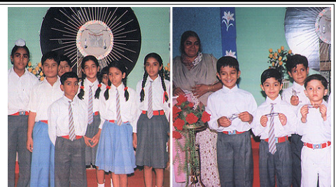
STUDENTS OF SACRED HEART CONVENT SCHOOL, FAZILKA, PUNJAB WHO GOT THE GIFT OF CLEAR EYESIGHT ON OCTOBER 26-27 DURING THE PRAYER SESSION