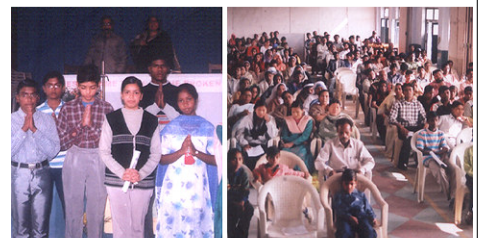
THE SPECIAL WITNESSES (on left) AND THE GATHERING FOR THE PRAYER SESSION AT HATHRAS ON NOVEMBER 15 (on right)

The Angel said, "I am bringing you good news of great joy for all the people: to you is born this day in the city of David a Savior, who is the Messiah, the Lord. This will be a sign for you: you will find a child wrapped in bands of cloth and lying in a manger." (St. Luke 2:10-12)