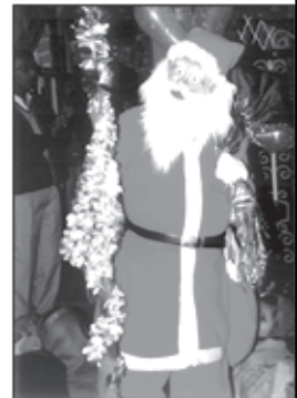
DANCE WITH SANTA...