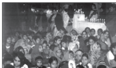
ALL CELEBRATE WITH JOY!