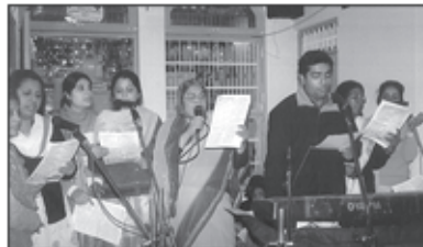
THE CHRISTMAS CHOIR! SING ALLELUIA!