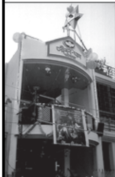
JEEVAN DHAM ON 25TH