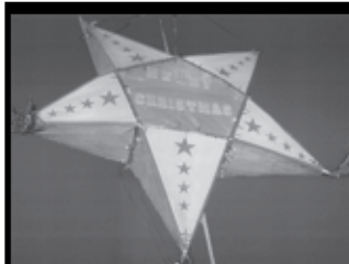
THE BRIGHT CHRISTMAS STAR!

Husband: Joseph; Relatives: Zechariah and Elizabeth