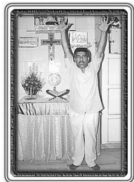
Praise be to Jesus! Thanks be to Jesus!

NOTHING IS IMPOSSIBLE FOR GOD! HE HEALED MY PARALYSED BODY!