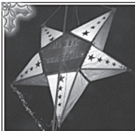
THE GLEAMING CHRISTMAS STAR