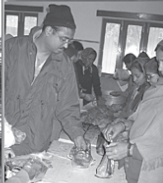
PACKING (POORI-HALWA) ON THE GO...