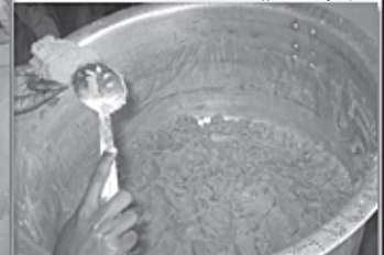
TAKING OUT THE DELICIOUS HALWA...