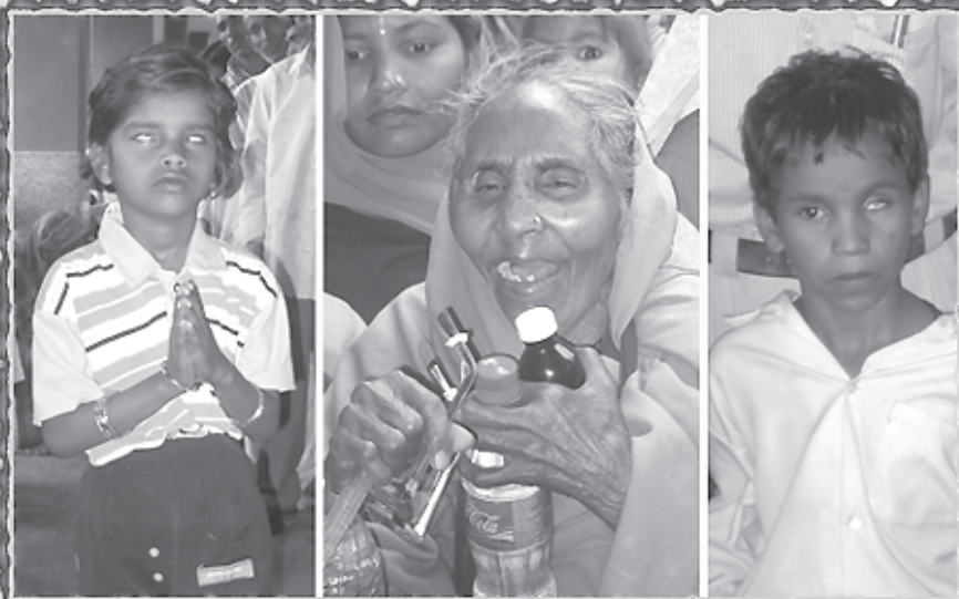
THE BLIND GOT THE GIFT OF VISION ; EVEN THE TOTALLY BLIND CAN SEE

On March 20, Palm Sunday , eyesight was restored to so many persons who were blind (some blind by birth), and hearing to many who were deaf (most of them with a broken eardrum), ushering in a strong wave of faith and joy in the believers. While some were awestruck and speechless, others were praising God with their whole might because they witnessed the manifestation of the healing power of God. Given below are the snaps of those who got the gift of vision and hearing.