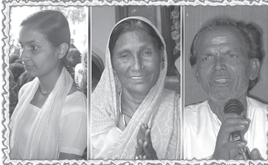
THEY HAD BROKEN EAR-DRUMS ; GOD GAVE THEM THE GIFT OF HEARING

"For the law of the Spirit of life in Christ Jesus has set you free from the law of sin and of death." (Romans 8:2)